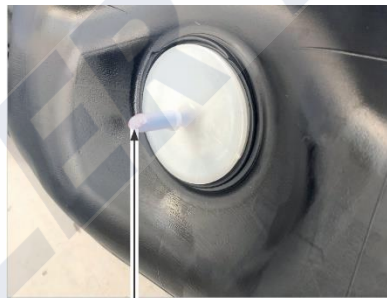
Figure 1 Auxiliary Fuel Port

Heating the Blue fuel line after the large end of the elbow will remove any curve in the tube and ensure the dip tube does not curl up