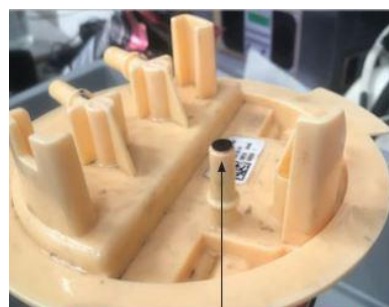
Figure 3 Auxiliary Port