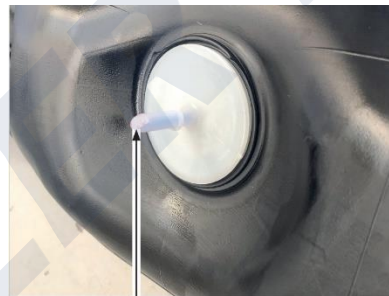
Figure 1 Auxiliary Fuel Port

Feed the Remaining line to the fuel pump and secure using the remaining rubber hose and clip.