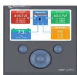
Color Control GX