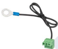
Connector with preassembled DC minus cable (included)