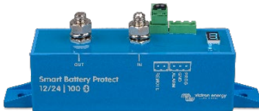
Smart BatteryProtect BP-100