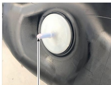
Figure 1 Auxiliary Fuel Port

i Heating the Blue fuel line after the large end of the elbow will remove any curve in the tube and ensure the dip tube does not curl up